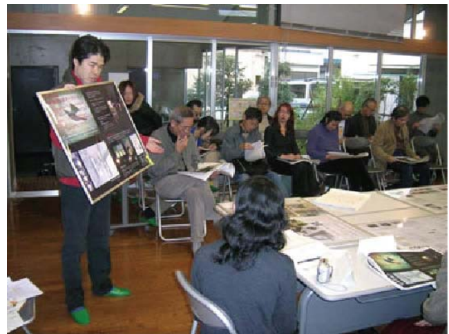
Idea competition for utilizing vacant shops

As for the shopping street project, it was aimed at revitalizing the sleepy street where almost half of the shops were shuttered. In 2004 an idea competition was held to invite proposals for reusing vacant shop spaces and a management solution that could contribute to the whole shopping street. The plans were gathered from all over Japan.