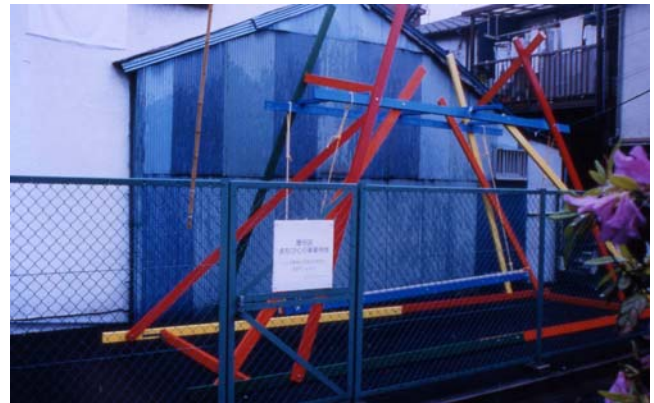
Art exhibition held in a vacant lot

Artists and architects gathered not only from around Japan but also abroad. It triggered a review of regional resources and new approaches to the problems of the community.