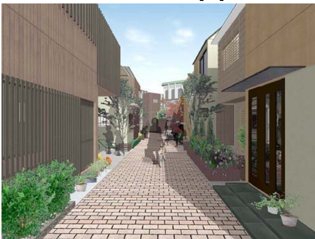
Image after rule of district

The frontages of the houses (a private area) and surfaces of the alleyways (public space) created a synergy that brings comfort to the alley space.