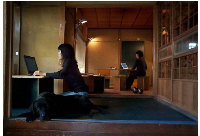
Experiment of utilizing empty house as SOHO

The art projects and various social experiments in the expo shed light on the values and possibilities of unused resources, such as vacant lots and empty houses. People began to consider the practical use of those resources.