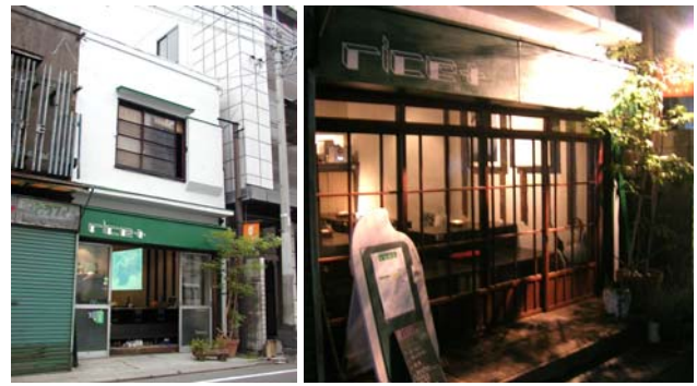
Community café renovated from an old rice shop

Let’s take a close look at one of those examples.