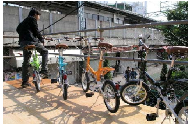
“Art & Net project”: utilization of abandoned bicycles

As for the shopping street project, it was aimed at revitalizing the sleepy street where almost half of the shops were shuttered. In 2004 an idea competition was held to invite proposals for reusing vacant shop spaces and a management solution that could contribute to the whole shopping street. The plans were gathered from all over Japan.