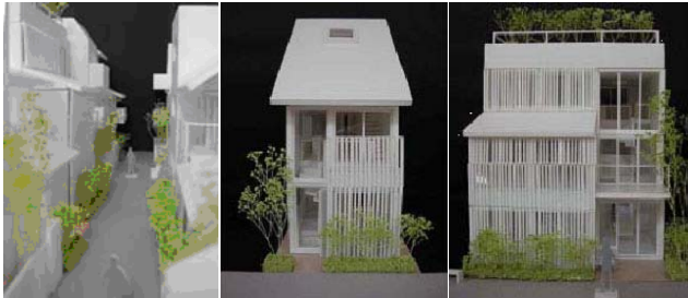
Models of proposed houses

ideal, considering the relation with alleyways. Based on the opinions from the workshops, computer generated images and animations were created to give a more concrete image of the townscape and they were examined in detail.